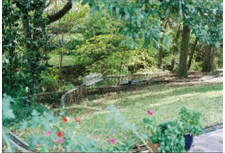
A beautiful scene featuring a trestle spanning the decline of Franks yard. Let's only hope the weather is this beautiful!

The Tophill and Valley Railroad has been three years in the making. It covers the perimeter of the backyard on a large lot overlooking a creek. Since the backyard slopes downward, elevation was a big factor in the design of the railway. We wanted a road that a train could stretch its legs on and at the same time maintain a backyard. The railway is still under construction, as it was only three weeks ago that the first train made a complete trip around the yard. The road is double tracked except for the steepest part found on the west end of the line where a single track sits on a metal trestle. After the line straightens out at the bottom of the Valley, the metal trestle turns to wood and is soon joined by a second set of tracks from another wooden trestle which passes over it. There are numerous switches between the double tracks, but for now they are not wired up and only a single track is usable.