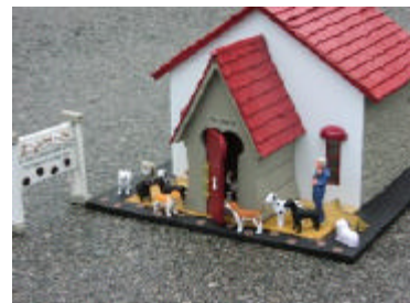
The Vet's Office

Directions : Take Central Expressway (US75) north to the Bethany exit in Allen. Turn right (East) Go 6 miles to the Lucas Store (FM3286) Turn left (still going East!) Go 7/10 th of a mile to Woodview Court on the left (this is just past Winningkoff Road on the left) Bear to the left on Woodview Court and drive to the end, This is 18 Woodview Court