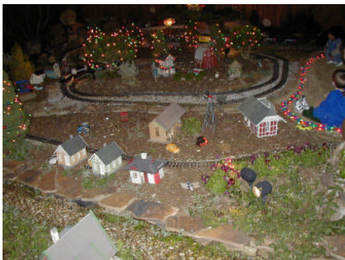
Sachse Central and Purple Mountain Railroad Pictured above.