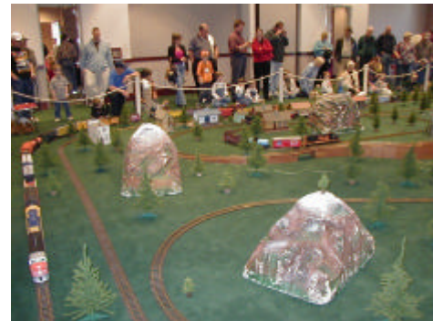
Plano Train Show 2003