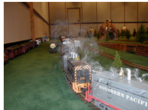
Diesels smokin' around the bend