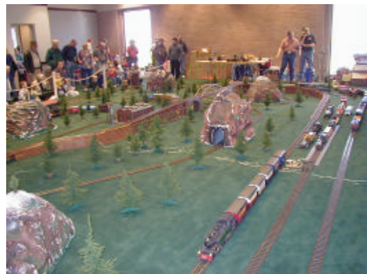
The N.T.G.R.C. display at the Dallas Area Train Show 2003 at the Plano Centre

Thanks to those who were there to set up and tear down. We couldn't have done it without you.