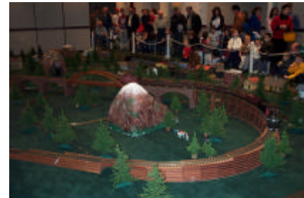
Plano Train Show 2002

Also dues are due for 2003. Bring your dues and pay them at the show. The new dues are $15.00 per individual or household.